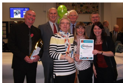
Cotgrave Festival (Building Strong Communities)