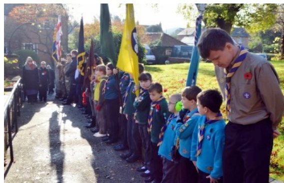
Uniformed organisations standards line the church path