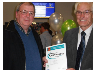
The WW1 Project (Building Strong Communities.)