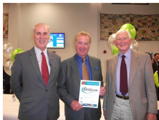
Cotgrave Neighbourhood Watch (Making Communities Safer)

Cotgrave had received several nominations in various categories:-