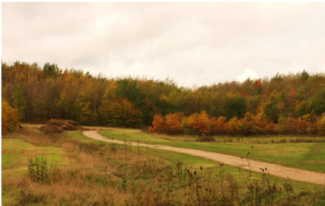
Approaching Leaky Hollow

We are now coming to the year end and getting ready for winter in the park. The park has different appearances over the year according to the seasons but my favourite has to be now. It looks splendid in its autumn colours. The grass has had its end of season cut and this does tend to make some areas look more open.