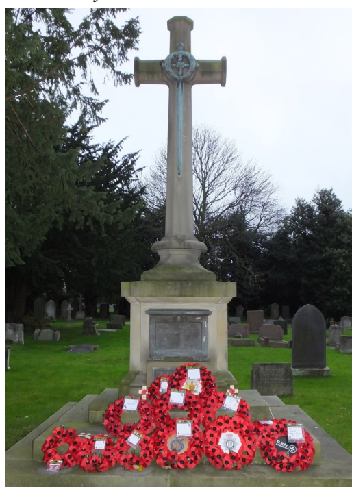
The Cotgrave War Memorial with Wreaths.

Later 70 members of CBOC Branch and their friends enjoyed an excellent lunch at the Nottinghamshire Golf and Country Club.