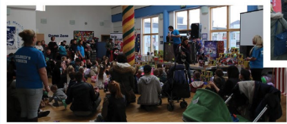
KID'S EASTER PARTY