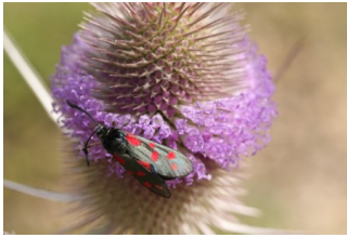
6 Spotted Burnett Moth

Not a lot of activity has taken place during the summer but there are some quite important announcements which are worthy of a mention.